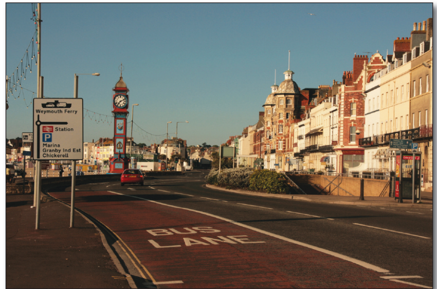
The Jubilee Clock, Weymouth showing the Esplanade widened out around it in the 1920s.